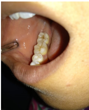
Fig. 3: Complete remission of lichen planus on right buccal mucosa after six months