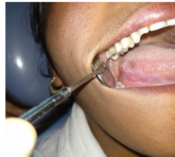
Fig. 2: Reticular pattern present on right side of tongue