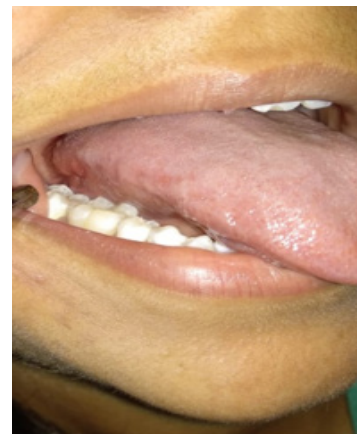
Fig. 4: Complete remission of lichen planus on right side tongue after six months