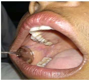
Fig. 1: Reticular pattern lichen planus present on right buccal mucosa

Based on the clinical examination, case was provisionally diagnosed as reticular lichen planus. Hematological examination and biochemistry yielded negative results. Biopsy was performed and the H&E stain analysis showed diagnostic features of lichen planus. Then, patient given a regimen of anti-oxidant twice/day (Cap. Lycostar®) and topical cortico-steroid triamcinolone acetonide 0.1%